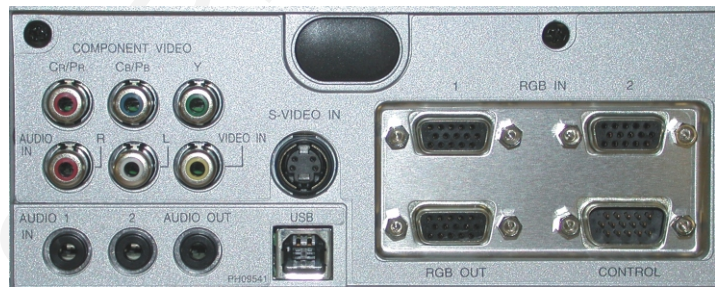
The ImagePro 8801A inputs are easily accessible.

We have taken the majority of features found in our best selling XGA projector and put it into a 7 lb. package. So you now have a dynamo projector that is 7 lb. lighter. The new features on the ImagePro™ 8801A include Component Video and HDTV compatibility. This projector is perfect on the road or in the ceiling. It also has a much quieter operation with whisper mode setting, plus a 400-1 contrast, and a Kensington slot for secure installation. A custom start-up screen and digital horizontal & vertical keystone correction complete the features.